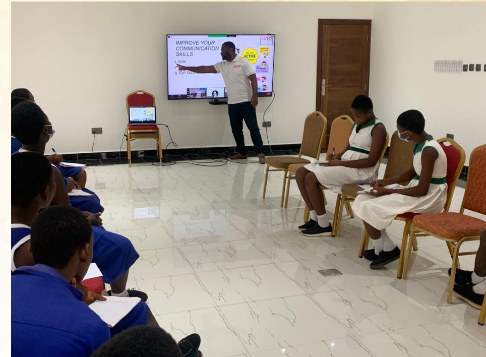
Hybrid lesson in Ghana simultaneously held in Cameroon and Zimbabwe: Improve your communication skills