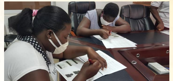
Young people at the Competence Check for the CRAN apprenticeship program "CAP". More than 70 people checked. Worked with the digital pen.